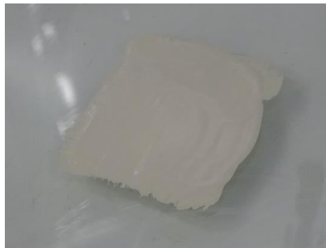
Photograph 1: test sample 89122 Copperant Altra Grondverf